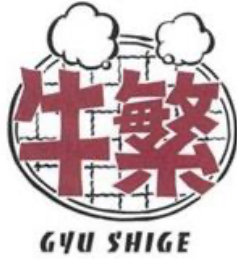
EXHIBIT G LIST OF FRANCHISEES